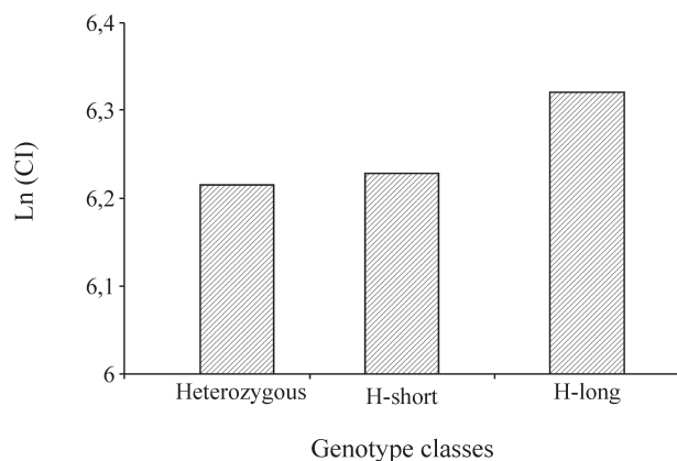
Figure 1 - Natural logarithm of mean calving interval (CI) obtained from different genotype classes of the HEL5 locus grouped into homozygous for short alleles(H-short), homozygous for long alleles (H-log) and heterozygous. When homozygous for short alleles and heterozygous were grouped, the difference was significant ( p = 0.022 ).

a, b, c Values with different superscript in the same row differ significantly ( p < 0.10 ).