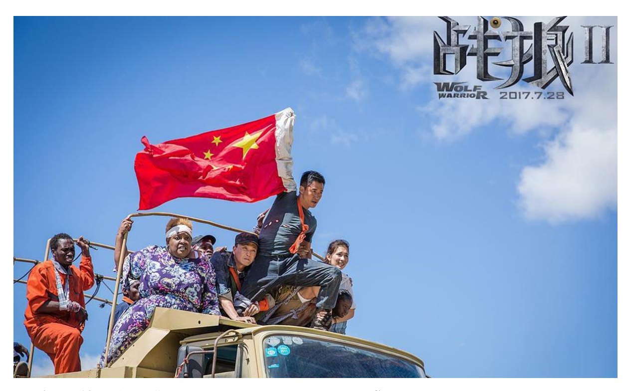
Figure 10 : Chinese flag saves the day in Wolf Warrior 2 .

The film consistently highlights the positive relationship between the Chinese and Africans. In one notable scene, the Chinese Ambassador in the fictional African country bravely stands in front of guns during a civil war to protect civilians, proclaiming, "Stand down! We are Chinese! China and Africa are friends." Miraculously, the rebels lower their weapons, and the innocent civilians find refuge on a Chinese vessel. In another instance, while traveling with survivors in a pickup truck through a conflict-ridden area, Leng Feng raises the Chinese flag high above his head to demonstrate their peaceful intentions. The rebels immediately recognize the flag and refrain from firing, acknowledging, "It's the Chinese! Hold your fire!"