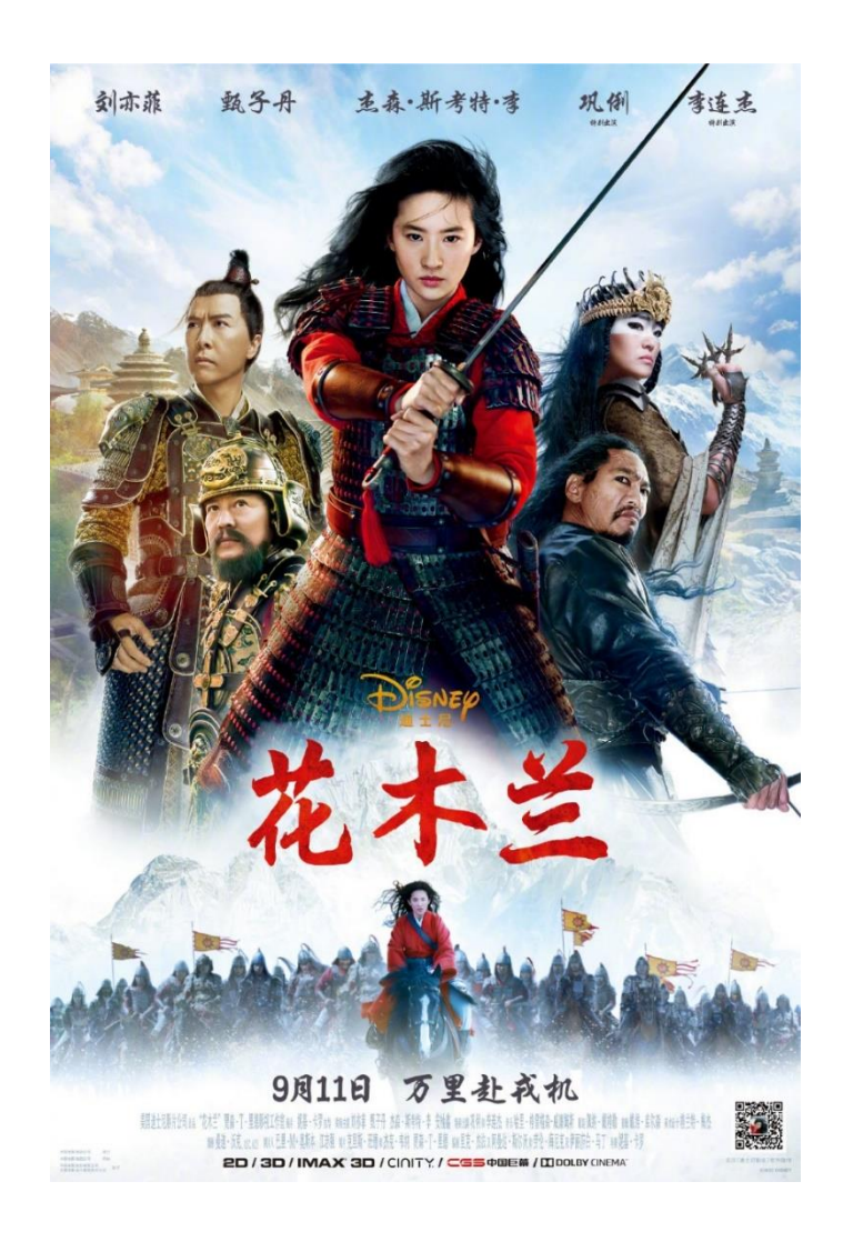
Figure 1 : Chinese poster of Mulan . Source : promotional material.