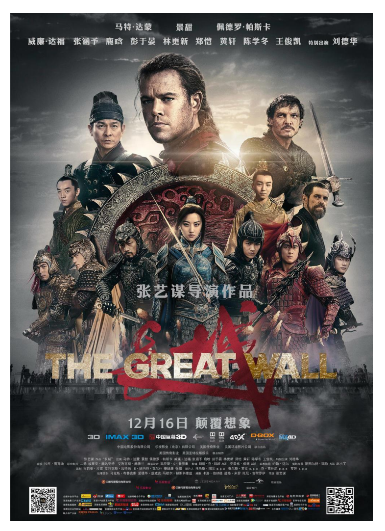
Figure 4: Chinese poster of The Great Wall.

as a soft power instrument to disseminate its strategic narratives.