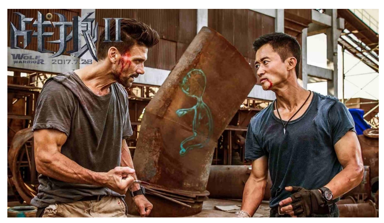
Figure 9 : Big Daddy and Leng Feng fighting at the end of Wolf Warrior 2 .

Chris Berry (2018) also discusses the ending scene of the film, where a picture of a Chinese passport appears on-screen, accompanied by the message: "Citizens of the People's Republic of China, when you encounter danger in a foreign land, do not give up! Please remember, at your back stands a strong motherland." Berry (2018) suggests that the inclusion of this message reflects a broader concern about the anxiety of venturing overseas as a new experience, as well as a specific worry about the Chinese government's ability to assist its citizens in times of trouble. In the past, few citizens of the People's Republic ventured abroad, but over the last decade, there has been a significant increase in Chinese students and businessmen traveling worldwide. Chinese outbound tourism has experienced explosive growth, surpassing the United States as the most important outbound tourism market.