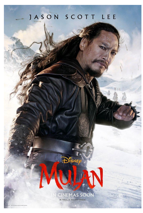
Figure 3: A poster of Mulan depicting the villain, Bori Khan.

This point is especially relevant, as it speaks directly to China's goal of using Hollywood films to promote its narratives. According to Kokas (2020b), "We're accustomed to thinking of Hollywood as a vehicle of U.S. soft power. 'Mulan,' though, exemplifies how Beijing has deputized it to advance China's political interests and national narrative." The scholar explains that, although Mulan (2020) was initially praised for "embracing diversity" and "pushing themes of identity and girl power," the real antagonist of the movie is not the patriarchal society that prevents Mulan from realizing her true identity and potential. It is, rather, the ethnic "others," who are subtly shrouded in black and work to undermine the Han Chinese ethnostate (Kokas 2020b).