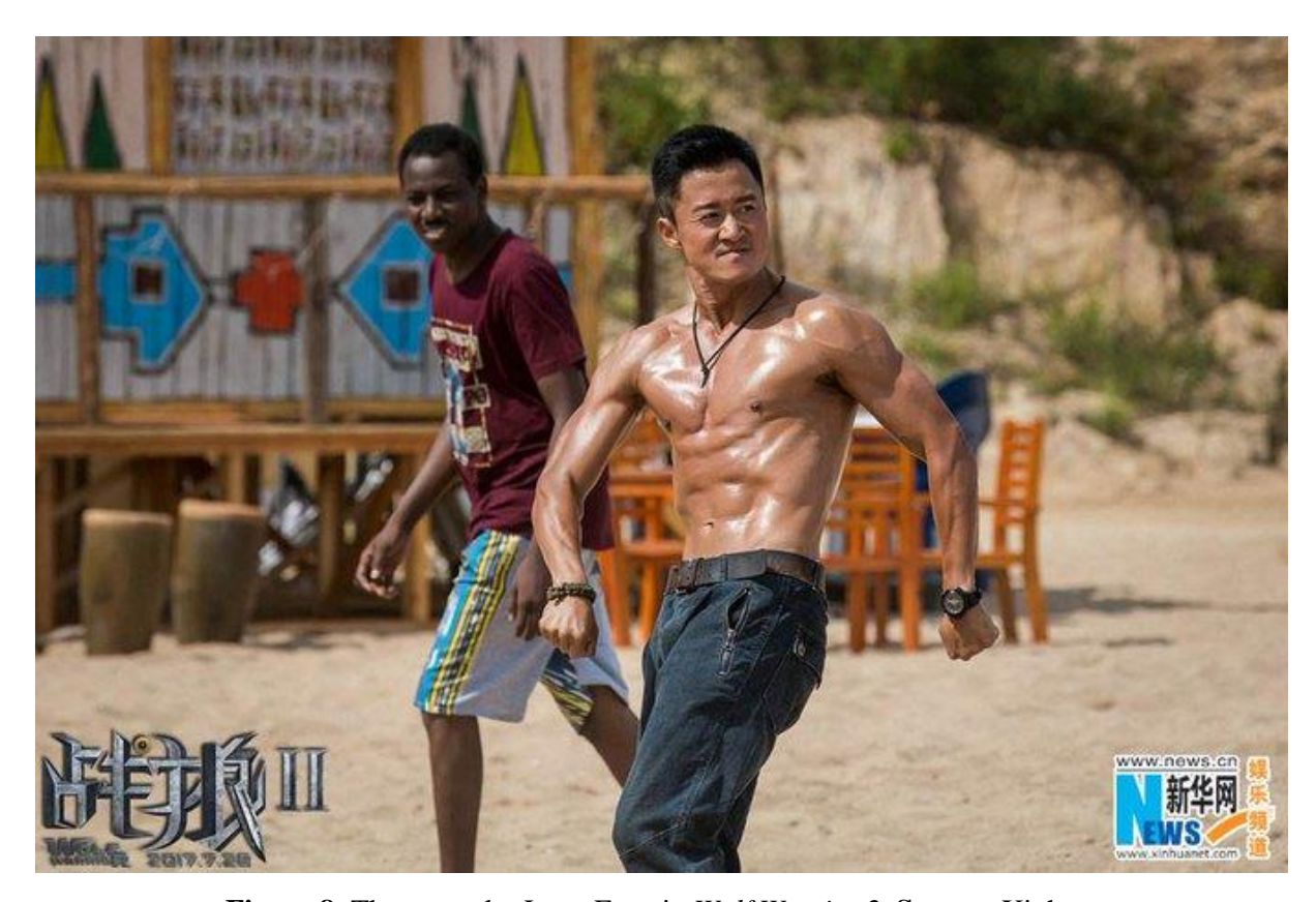
Figure 8: The muscular Leng Feng in Wolf Warrior 2.

As Schwartzel points out, this storyline is reminiscent of familiar American action films, following what he refers to as the "Bruce Willis template." Wu Jing's character, in his efforts to protect the locals from terrorists and mercenaries, embodies the spirit of Sylvester Stallone (Schwartzel 2022). Despite being surrounded by machine-gun fire, he miraculously avoids getting hit. He effortlessly takes down numerous adversaries using switchblades and martial arts techniques. He displays compassion towards young children and outperforms others in drinking contests. In an impromptu soccer match, he scores a goal and proudly flexes his muscles to impress the women. When resources are scarce during a critical battle, he ingeniously crafts a deadly arrow using poisonous sap extracted from a desert cactus, demonstrating his resourcefulness in the face of adversity (Schwartzel 2022).