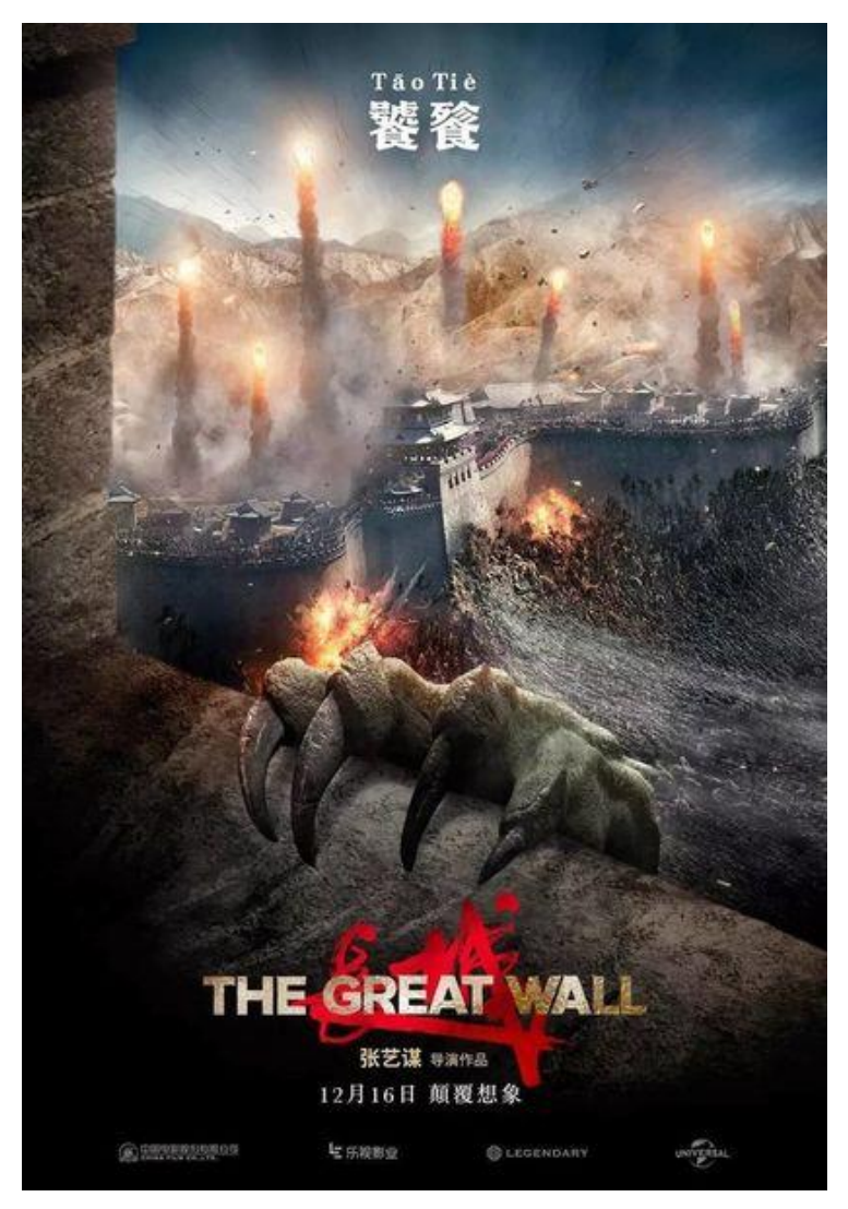
Figure 6: The monster Tao Tie climbs the Great Wall.

The authors comment on the history of China-Hollywood relations, emphasizing the recent emergence of monster films in China. They highlight the evolution of these films from low-budget projects to blockbuster hits that cater to the evolving tastes of a consumer-oriented society. The Great Wall serves as an example of the convergence between local and global elements, where different ideological positions and cultural legacies coexist and compete (J. Yang, Jiao, and Zhang 2020).