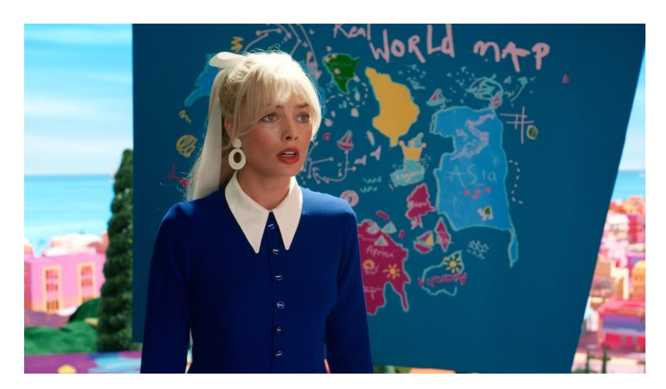
Figure 7 : Still from the movie Barbie with the supposed representation of the nine-dash line map. Source : Donnelly 2023.

Interestingly, the 2023 Hollywood movie Barbie sparked controversy even before its release due to the supposed inclusion of the nine-dash line. Vietnam has banned the film, citing a scene featuring a map that depicts contested Chinese territorial claims in the South China Sea, as reported by Nicholas Yong (2023). Meanwhile, in the United States, Republican Senator Ted Cruz has accused the movie of being Chinese communist propaganda, expressing concern about its potential influence on young girls (Rich 2023). In response to the polemic, a spokesperson for Warner Bros. Film Group, the movie's producer, stated that "The map in Barbie Land is a child-like crayon drawing. The doodles depict Barbie's make-believe journey from Barbie Land to the 'real world.' It was not intended to make any type of statement" (Donnelly 2023).