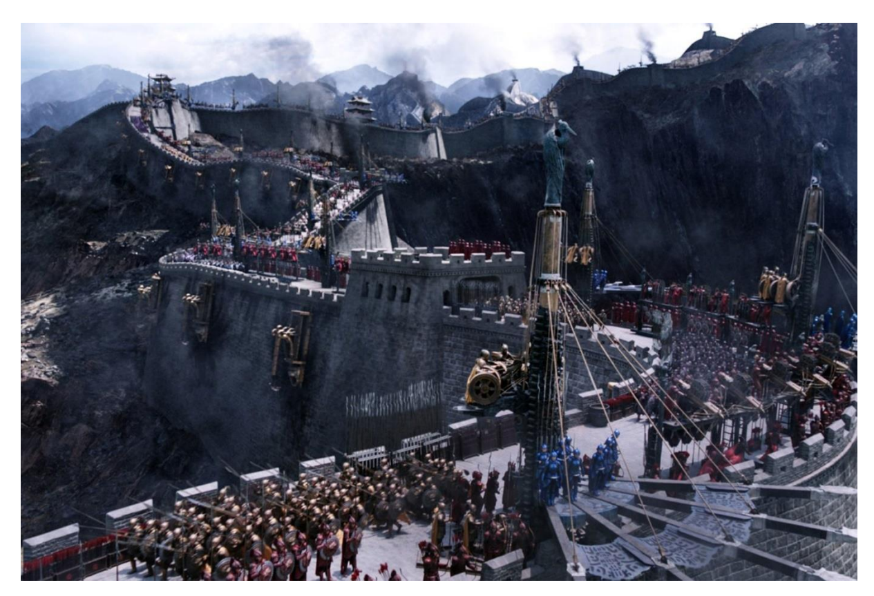
Figure 5: The Great Wall and China's military might. Source: promotion material.

William Garin (played by Matt Damon): Look at this army. Have you ever seen anything like this? Pero Tovar (played by Pedro Pascal): Incredible.