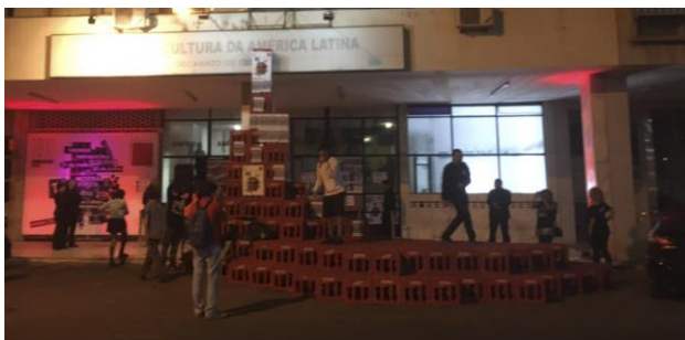
Figure 8: musical presentation at "Tubo de Ensaios" event.