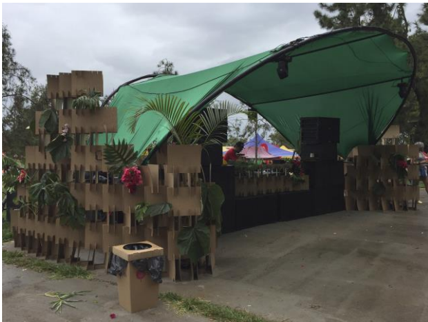
Figure 5: cardboard closure for Picnik event.

The second product of scenography, produced this time by the Picnik group, should work as a closure to protect the musicians' tent (Figure 5) of the event at the City Park of Brasilia. The main idea was to create a tropical ambiance, with a rustic aspect, that made up floral arrangements. The structure had to be quite functional, with basic fittings and simplified assembly. Therefore, a single 3mm cardboard module was chosen to be the most efficient solution, with matching fittings for all boards.