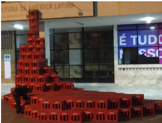
Figure 7: crate parklet in front of CAL's headquarter.

An idea of creating a relation between the CAL building and its urban context guided the design of the parklet, and in that sense, it established a relationship between the facade of the building and the car lot located in front of it. The occupation was part of a political action of the CAL in relation to the right of use of public spaces and the momentary withdrawal of vehicles, returning such spaces to the population and creating new environments of coexistence (Figure 7).