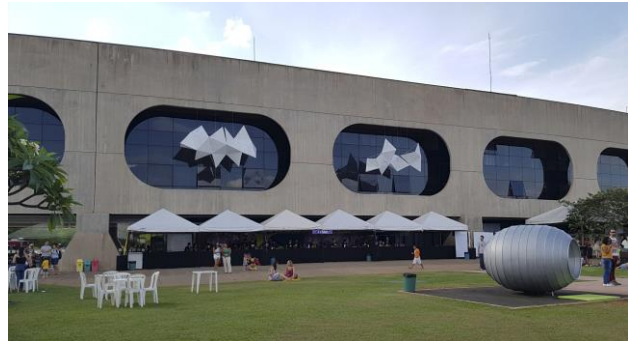
Figure 3: second assembly of "The Mobile" structure.

The second opportunity to assemble "The Mobile", with basically the same properties of the first time, that is, a piece to receive video projection, took place inside the Centro Cultural Banco do Brasil - CCBB, in Brasilia (Figure 3). The piece was part of the scenography project of singer Criolo concert.