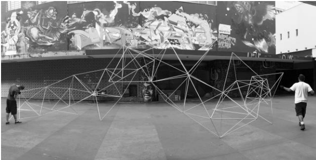
Figure 1: first assembly of "The Mobile" structure.

The first sequences of mounted pyramids remained in the gallery until the first day of the festival, the second day of the assembly process. Three sequences were then removed from the gallery to a larger space, specifically the square in front of the entrance of the Dulcina de Moraes Theater (Figure 1). There the sequences were connected to each other and already remained for exhibition and interaction with the public.