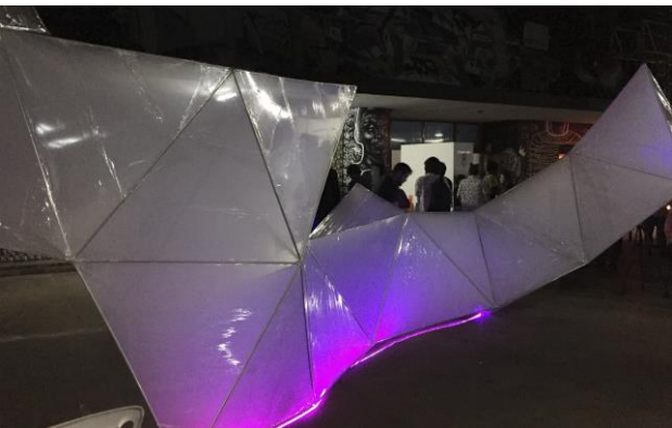
Figure 2: "The Mobile" enveloped with plastic film and filled with dry ice.

After the completion of this stage, which turned the three separate sequences into a single whole piece, the plastic film was applied, one of the most exhaustive and time consuming stages. The plastic film envelope was only finalized on the third day of assembly, second day of festival. On that day, dry ice was injected into the envelope and the piece was colored with LED stripes, creating an ambiance during the night (Figure 2). The idea was to broaden the sensory experience of the public, since "The Mobile" occupied the entrance space of the event, where the participants stayed before the concerts.