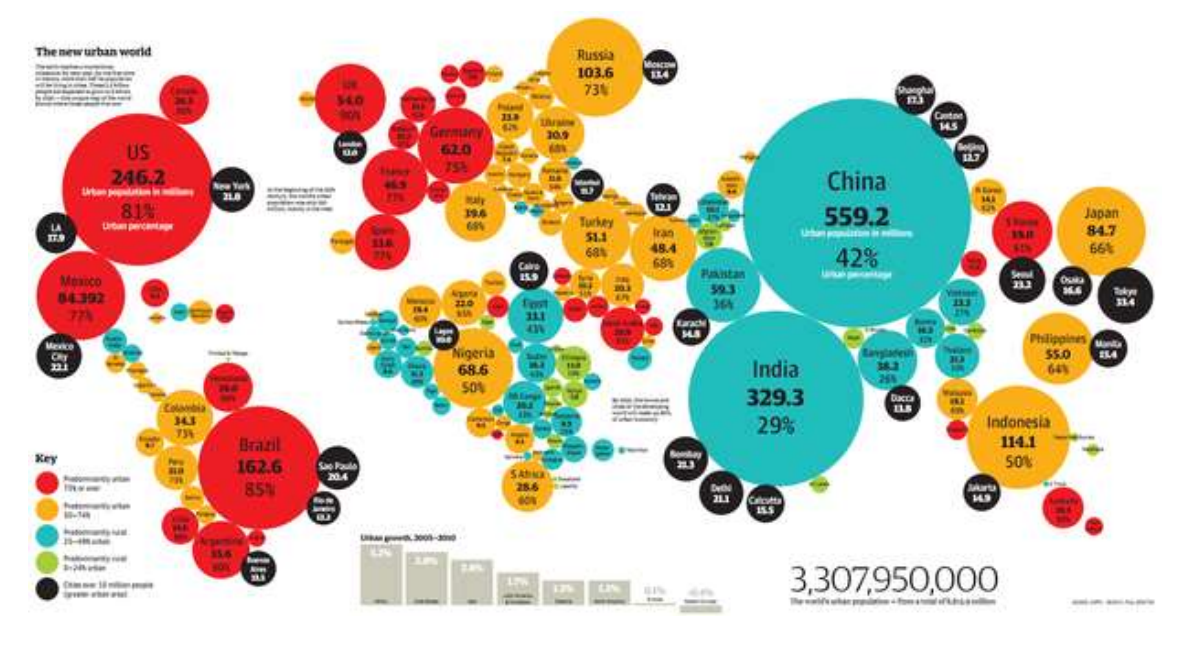
Figure 3. World urbanization graphic

In recent years, the world in general, and Brazil in specific has gone through a rapid process of urbanization (Figure 3) (Gobbi 2016; Vidal and Scruton 2007).