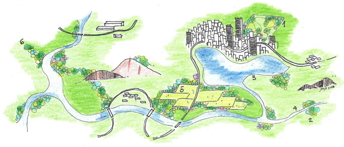
Figure 1 - The system of green areas and its various elements.

For some researchers there are tenuous points that differentiate spaces such as green or not, inferring the need for a certain tree quantity, the pure existence of plants or even the presence of social and economic functions (MACEDO, 1995; BENINI, MARTIN, 2010). For this research, it is believed that just having trees, such as on a tree-lined street, is not enough, being important to identify urban green areas systems (UGAS) , which will include both more consolidated and more fragmented spaces. Although all vegetation, in isolation, has its environmental, social and economic contribution, the systems to which they belong encompass functions of a larger character in cities. The urban and peri-urban UGAS is thus composed of isolated fragments, green corridors, parks (1), squares, forests and groves (2), waterfronts (3), permanent protection areas (APA's) or areas of relevant ecological interest included in the system of conservation units (APA's, ARIES etc.) (6), legal reserves, backyards, lawns (4), gardens, vegetable gardens and orchards (5) (Figure 1). Certain areas may be within others, such as gardens and backyards or parks that may be inserted in APA's, but what matters to us is that the landscape is formed by a mixture of these spaces added to the interaction with the built. Then, we see the relevance of having instruments that enable this whole system to be implemented and maintained for an improvement of its functions in cities.