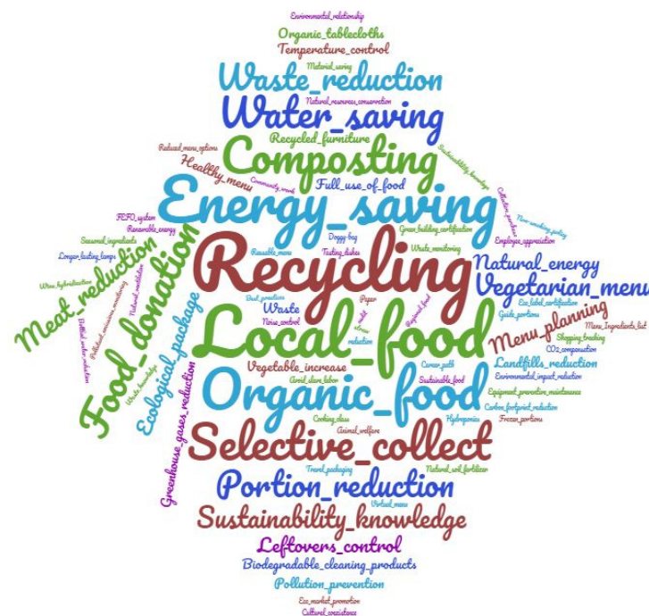
Figure 2. Word cloud of the main sustainable activities mentioned by the studies.

The activities that were most performed among food services and that have a positive impact on sustainability were: purchase of local or seasonal products—51.61% (n = 16); selective collection or recycling of solid waste—51.61% (n = 16); energy reduction or purchase of equipment with better energy efficiency—38.70% (n = 12); purchase of organic or sustainably produced food—32.25% (n = 10); water reduction or conservation—29.03% (n = 9); composting—25.80% (n = 8). Figure 2 shows the main sustainable activities mentioned in the studies. The main sustainable activities were also evaluated in each sustainability indicators (environmental, social, and economic) (Figures S1, S2, and S3—Supplementary materials).