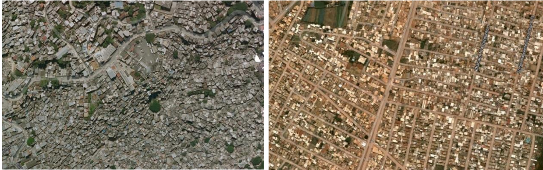
Figure 1 – Difference between favela and informal allotment: Rocinha, Rio de Janeiro (left) and Sol Nascente, Brasília (right).

associated initial cost, that of buying the lot (Davis, 2006), and the prior and global organization of spaces, makes the process seem quite different from that of favela.