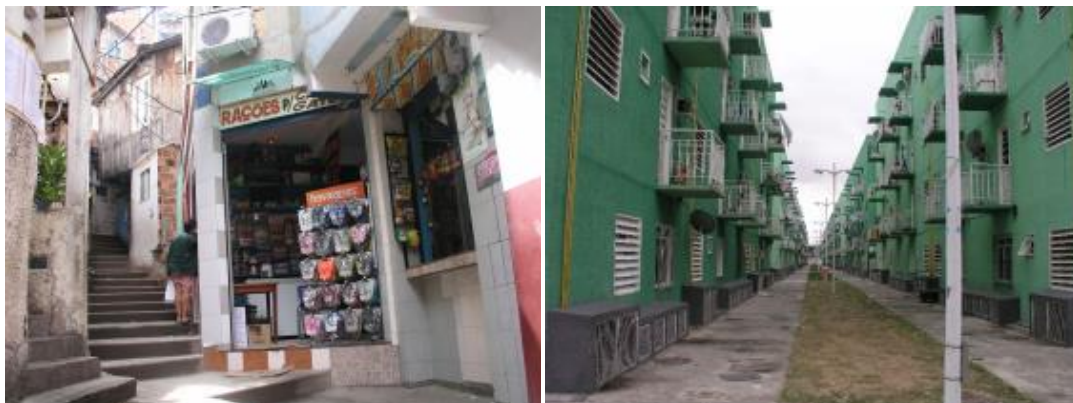
Figure 2 – Spatial contrast between favela (Left: Dona Marta, Rio de Janeiro, Brazil) and social projects in Rio de Janeiro (Right: PAC Social Project, Manguinhos, Rio de Janeiro, Brazil).

The dynamic life in the favela seem to be close to that of the so-called "traditional" city (both in European and Brazilian colonial terms), whose commerce often occurs on the ground floor and the upper areas are designated