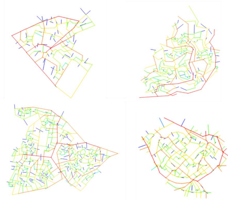
Figure 4 – Normalized choice patterns in two favelas (up left: Tiradentes, Belo Horizonte, Brazil; down left: Douala El Koudia, Marraquesh, Marroco) and two historical cores (up right: Covilhã, Portugal; down left: Beja, Portugal)