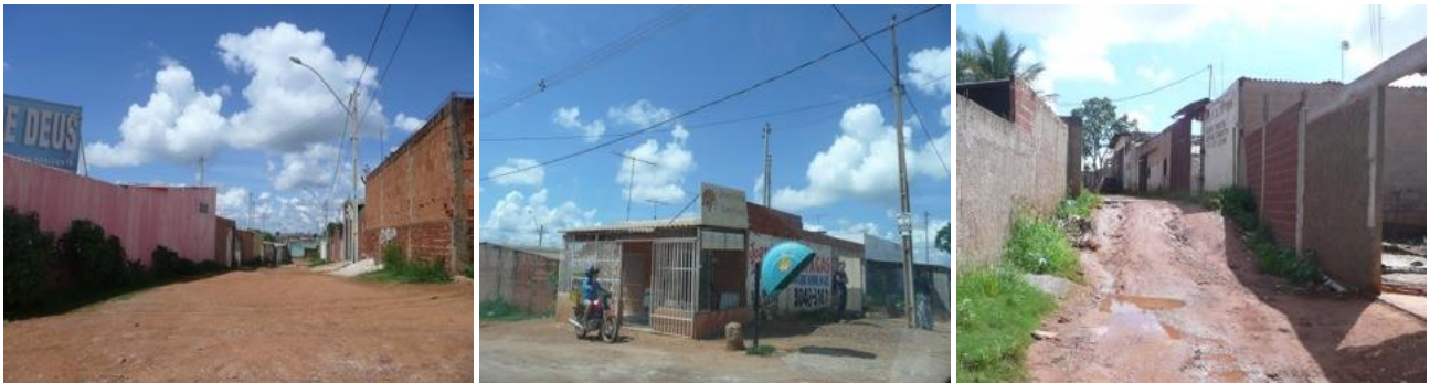
Figure 3 - Sol Nascente, Brasilia, Brazil.

It starts from the understanding of favela as something in permanent development, breaking with the tradition of perceiving in its informality something undesired, because like the city that embraces it, this is not a fixed state but a space in constant adaptation. This process that materializes over time allows it to adjust according to its own rules and emerging processes that Salingaros (2005) calls self-healing. The author considers that spaces such as favelas should be deeply studied and their spatial logics understood before any intervention, since it already contains useful properties to a proper development as an urban space (2005). Usually understood as spatially segregated fractions of strong organicity, they tend to remain interpreted in their problems and needs, so the inherent potential tends to be neglected or ignored.