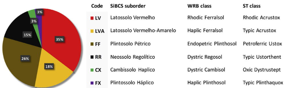
Fig. 2. Soil observations according to the Brazilian Soil Classification System – SiBCS [1] and corresponding World Reference Base – WRB [2] and Soil Taxonomy – ST [3] classifications.

The soil samples were air-dried, ground and sieved (2 mm mesh) and analyzed for physical and chemical determination according to Embrapa [5]. The spectroscopic analysis was conducted using the