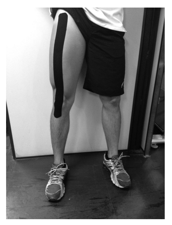
Figure 2. Illustration of the tape, after application.

After the calculation of the SB value and removal of the paper backing from the tape, the strip was applied with the subject lying on a bench with the leg positioned off, and the knee from the dominant limb flexed at 90° (Figure 2). The strip was stretched until it reached the DIS value, which according to the equation would produce a tension of approximately 40%. Tape was always administered by the same certified physical therapist (certified KT1/KT2).