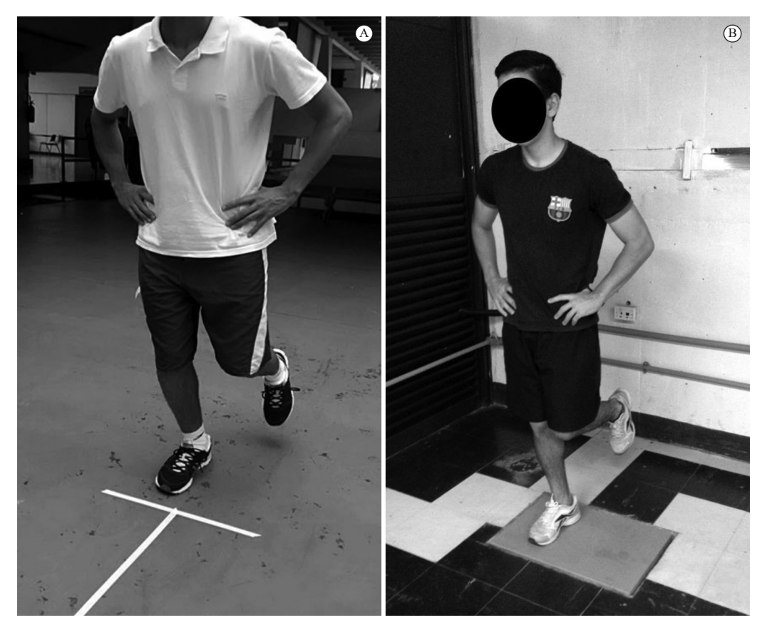
Figure 3. Illustration of the initial position of the hop test (A) and vertical jump test (B).

All measurements were taken from the dominant limb. The SHT started with the participants in single-leg standing behind a line marked on the floor with a knee slightly flexed for 10 seconds, until a verbal command was given (Figure 3). Immediately after the verbal command, they were asked to jump forward as quickly and as long as possible and to land with the same limb. In order to prevent influences of the upper limbs during the propulsion phase, subjects were instructed to maintain their hands on the waist. The jump was considered valid if the participants could maintain their balance for at least 5 seconds after landing. Subjects performed three SHTs with a 1-minute interval between tests, and the best attempt was used for analysis purposes.