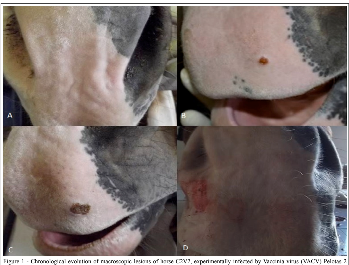
isolate A - Inoculation day. B - Day 4 post inoculation (pi) there is ulcerative and focal lesion on parasagittal-rostral region of left superior lip. C - Day 6 pi the reported lesion is persistent and it evolved to focally extensive scabby and proliferative lesion. D - Day 28pi, there are no lesions on inoculation site.

compared with infections caused by a single VACV isolate (CARGNELUTTI et al., 2012a). In contrast to observed in rabbits and mice inoculated with VACV-P1V and P2V, our results showed that horses inoculated with the same isolates presented milder lesions, and did not die after virus replication.