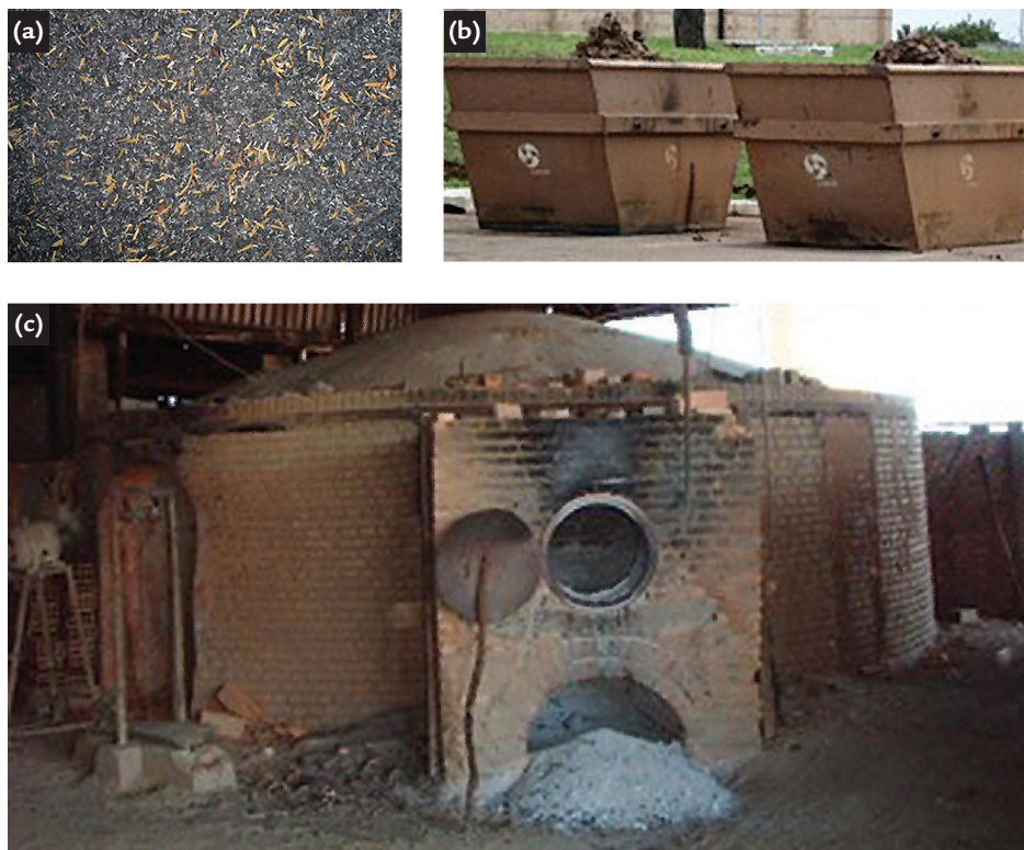
Figure 1 a) rice husk ash; b) buckets with sludge from water treatment station; c) wood ash from a ceramic industry.

In this work, three types of residues as an additive to ceramic mass were investigated for the production of ceramic coating. The residues studied were: rice husk ash (RHA), sludge from water treatment station (SWTS) and wood ash (WA), see Figure 1.