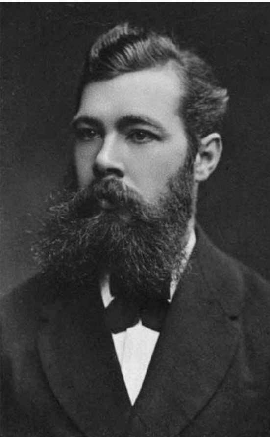
Figure 1: A young Hermann von Ihering