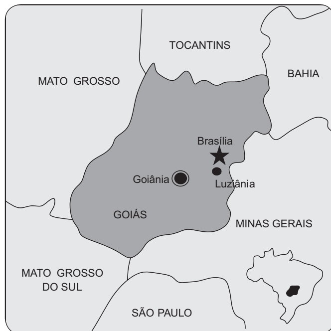
FIGURE 1 - Map of Brazil, highlighted the State of Goiás and the municipality of Luziânia.

The survey was conducted from August 19 to October 9, 2010 in 24 rural areas or farms affected by the epidemic in 72/73. All its inhabitants who agreed to participate in the study were included, and there were no exclusion criteria. The participants