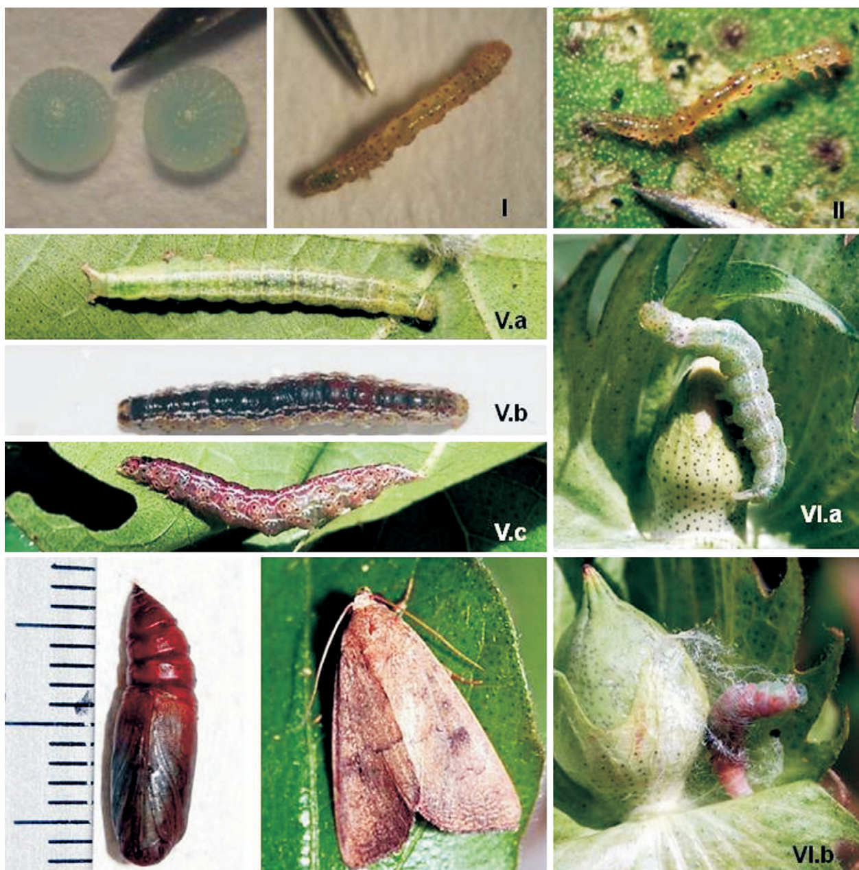
Fig. 2. Developmental stages of Anomis impasta – eggs, first (I) and second instar larva (II). Green (V.a), reddish-purple (V.b), and dark fifth instar larvae (V.c); green (VI.a) and reddish-purple (VI.b) sixth instar prepupa larvae. Pupa and adult female (J.B. Torres). Tips of entomological pin no. 000 indicate size of eggs, first and second instar larvae.

Larvae of first, second and third instars are slender and with greenish-yellow coloration (Fig. 2). They feed by scraping the leaves of the plant terminals and bracts, similarly to the common American cotton leafworm. As the third and fourth instar larvae increase in size, and start to have dark spots at the