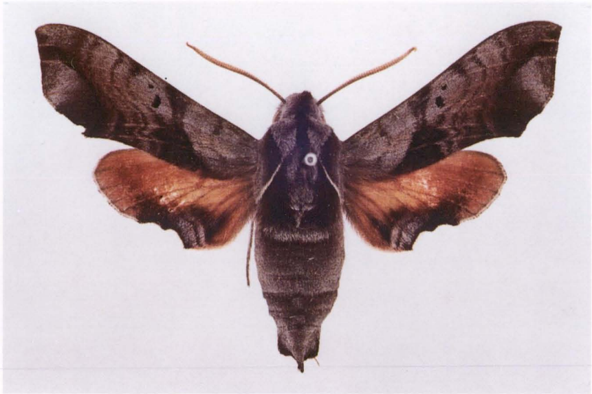
Fig. 1. Adult male of Nyceryx brevis sp. n., holotype, dorsal view.

ACKNOWLEDGEMENTS. The author is most grateful to Wellington Cavalcanti, staff artist, Centro de Pesquisa Agropecuária dos Cerrados (EMBRAPA), for producing the line drawings.