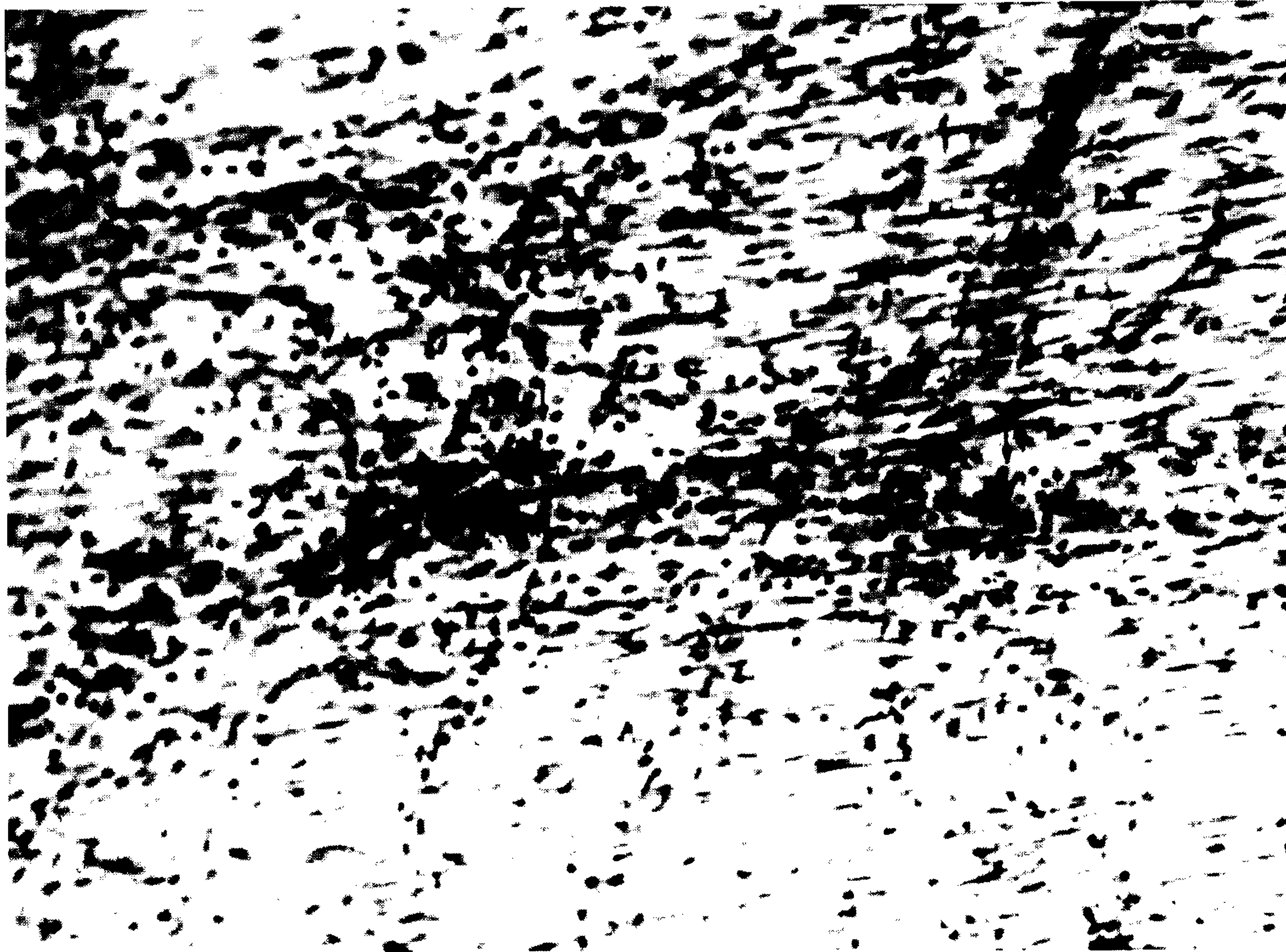
Figure 3. Microphotograph of a strip of intestinal smooth muscle incubated with 3 \times 10^6 immune lymphocytes of a rabbit with chronic Chagas' disease. Note penetration and adherence of immune lymphocytes to the parasympathetic ganglion cells (arrows).

* 3+, high degree of lymphocyte adherence and neuronolysis; 1+, mild degree of adherence and neuronolysis; 2+, intermediate values; ±, random lymphocyte adherence and no neuronolysis.