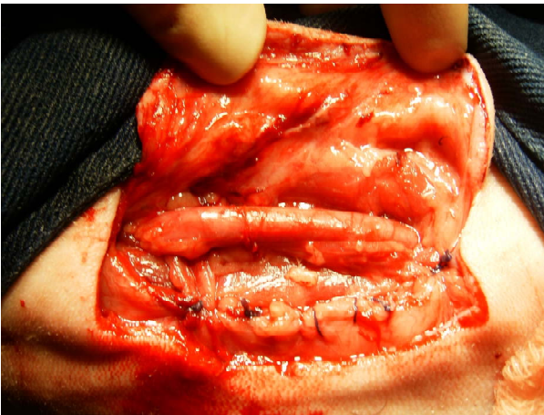
Figure 3. Isolation of the carotid artery and suture of esternocephalic and brachiocephalic muscle fascias covering the jugular vein.

dexamethasone (Dexacort, Marcolab, Sao Sebastiao do Paraiso, Brazil), IV, single dose, to avoid severe edema of the manipulated area, and 5 mg/kg of enrofloxacin (Zelotril 10%, National Union Pharmaceutical Chemistry, Embu Guaçu, Brazil), IM, every 24 hours for seven days. Dressings were applied daily with topical 0.1% polyvinylpyrrolidone (Riodeine, Rioquímica Pharmaceutical Industry, São José do Rio Preto, Brazil), and the suture was removed approximately ten days after the surgery.