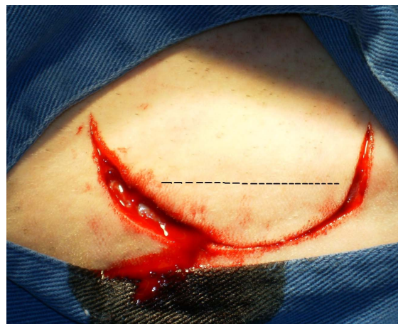
Figure 1. Incision in a half-moon shape in the skin surrounding the jugular groove (dashed line).

After surgery, the animals received cryotherapy for 15 minutes at the site of transposition, 10 mg/animal of