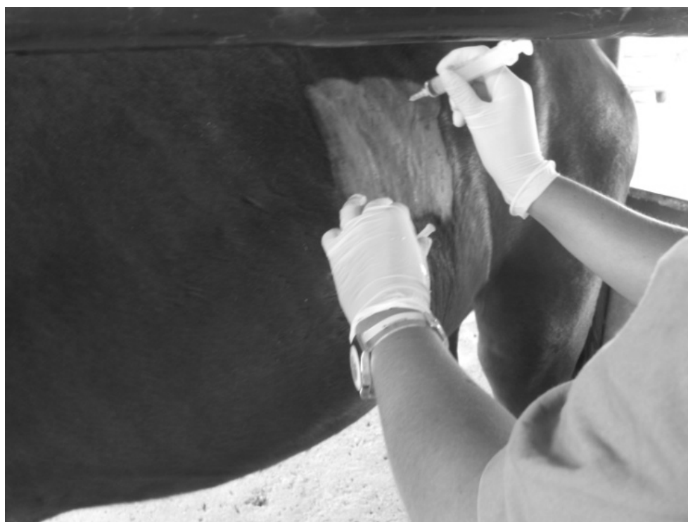
Figura 1 - Splenic puncture procedure. The 25 x 30 needle is inserted at 90° angle on the 17 th intercostal space.