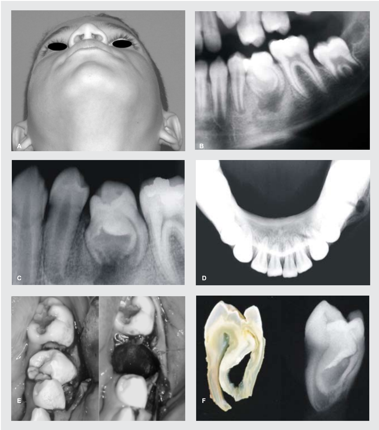
Figure 1. A – discrete swelling at the left side of the lower face; B – zoom of panoramic radiograph – Anomalous tooth in the region of the lower left second premolar associated with periapical lesion White arrow indicates periosteal bone reaction; C – preoperative periapical radiograph showing the mandibular left premolar with radicular dens invaginatus. Note incomplete dilated root with open apex and associated periapical radiolucent lesion; D – initial mandibular occlusal radiograph with low exposure exhibiting proliferative periostitis. Classic onion skin osseous buccal expansion extending from premolar and molar area. Note the osteolytic area in the new bone; E – photographs of the surgery. Beginning of extraction. It can be seen the abnormal size and morphology of the dens invaginatus. Photograph of the site of dens invaginatus extracted; F – longitudinal section of the extracted tooth shows extension of invagination beyond the open apex. Postextraction radiograph from lateral direction shows severe radicular dens invaginatus. Upper two thirds of invagination malformation are lined with enamel.