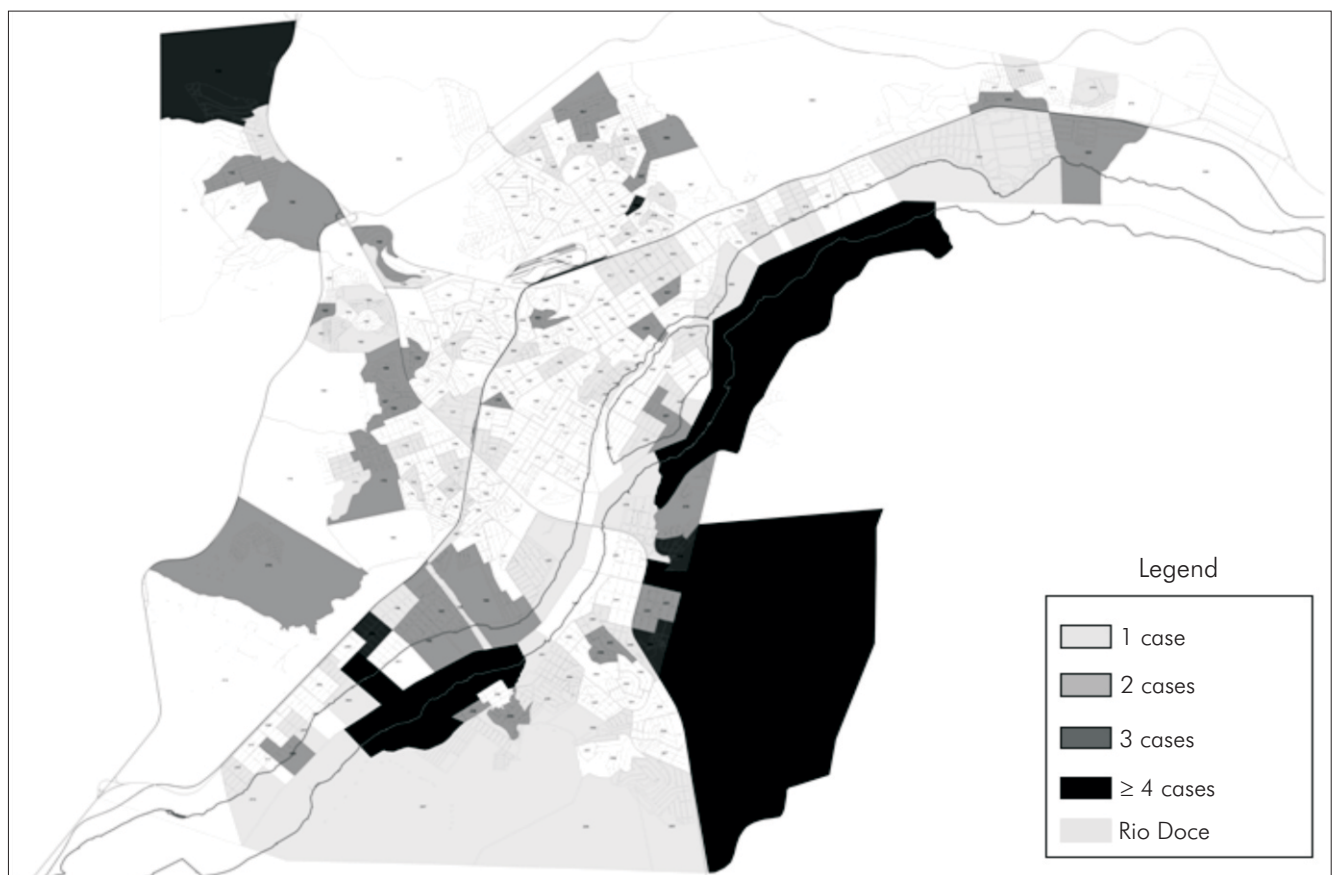
Sectors have been shaded according to the frequency of ATL cases as follows: (□) One case/sector, (▤) two cases/sector, (▥) three cases/sector, and (■) ≥ four cases/sector. The area shaded (▨) represents the Rio Doce.

Figure 2 shows the census sectors (n = 253) of the urban area of Governador Valadares shaded according to the number of cases, thus permitting the identification of areas where ATL was concentrated. Cluster analysis of the results permitted the classification of these census sectors into three groups, as shown in figure 3. The highest prevalence of ATL was in group III (15.99 per 100,000 inhabitants), followed by group II (15.10 per 100,000 inhabitants), whereas group I presented the lowest prevalence (11.38 per 100,000 inhabitants). The absolute and relative frequencies of ATL in these locations are provided in table 3.