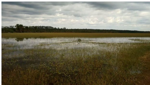
Fig. 2 Dissemination of Hyparrhenia rufa in Bonita Lagoon

Among the potential existing methods for sample collection and preservation, the National Guide for Sample