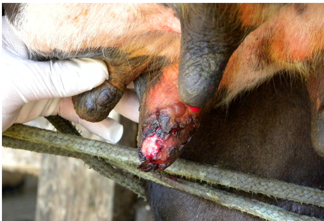
Fig.1. Dairy cow with severe swelling of teats. In addition, vesicles, papules and ulcers focally extensive are observed (Outbreak 6).

Histologically, multifocal areas of moderate to severe acanthosis, spongiosis, hypergranulosis and parakeratotic or orthokeratotic hyperkeratosis with adjacent focally extensive ulcers were observed in the epidermis (Fig.2). Numerous 3-8µm, circular, eosinophilic inclusion bodies were noted in the cytoplasm of the keratinocytes, mainly near of the areas showing acanthosis or necrosis (Fig.3). Inclusion bodies were not observed in some lesions with more than 15 to 20 days of clinical onset. Detachment of the dermal layer and necrosis with mild to moderate perivascular inflammatory infiltrate of lymphocytes, plasma cells, neutrophils and macrophages were observed in some areas. Adjacent dermis showed the same type of infiltrate. Eosinophilic extensive areas of serous material and cellular debris above the affected epidermis were prominent.