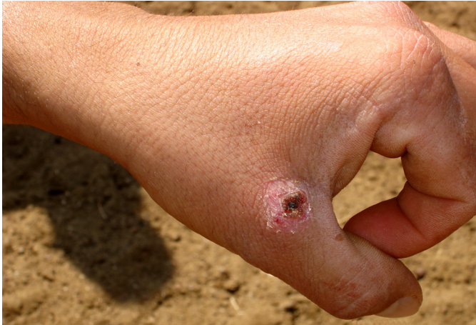
Fig.4. Milker presenting an ulcer with scab on the hand (Outbreak 2).

milking affected cows, starting with painful papules and pustules which progressed to ulcerative and scabby lesions by days 2 to 4. Treatment with antipyretic and analgesic was performed in most human cases. According to the owners, similar signs have never been observed before in the animals or people in the region. In all cases, the affected people aged from 18 to 31 years-old.