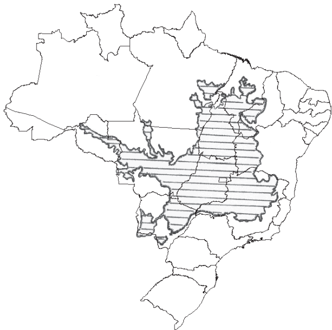
Fig. 1. Area of the domain of the Brazilian Savanna (adapted from Ab'Saber 1977).

Barra do Garças (MT) resulted from casual records of D. flexa , a species collected in an area of corn cultivation in the edge of a highway in 1986 (Vilela & Bächli 2000). Another similar case is D. eleonora , whose larvae were collected in bat guano by a speleologist group in expedition to the cities of Unaí, MG and Padre Bernardo, GO. These two records figure as the only collecting sites of drosophilids in both locations (Tosi et al. 1990). Second, there are sites sampled decades ago when the amount of described species was sensibly smaller than the current number of described drosophilids. This is the case in Carolina, MA, where a fast inventory was accomplished in the 1950's (Pavan 1959), as well as in Bela Vista, Caracol, Campo Grande, and Miranda (all in MS), and Barreira (BA), where quick inventories were carried out in the 1970's (Sene et al. 1980). These two aspects surely affect the number of species recorded at these places, because dozens of new species were ever since described and short inventories on few sites may not reflect the whole range of species diversity and distribution of a certain region.