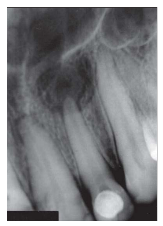
Figure 3. Radiograph taken 14 months after the beginning of the nonsurgical endodontic therapy. Note a remarkable decrease of the lesion radiolucency with partial resorption of the paste.