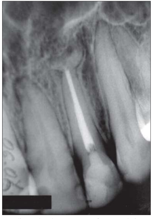
Figure. Radiograph taken 5 years after completion of the nonsurgical endodontic therapy. Note complete healing of the periradicular cyst and resorption of the paste.